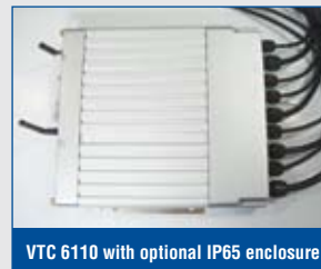
VTC 6110 with optional IP65 enclosure